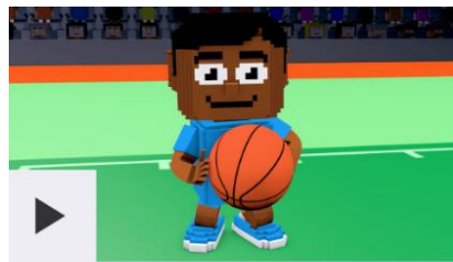
Physical Education KS1 / KS2: Hybrid Sports - Attacking and Defending

https://www.bbc.co.uk/teach/class-clips-video/physical-education-ks1-ks2-lets-get-active/z72yjhv